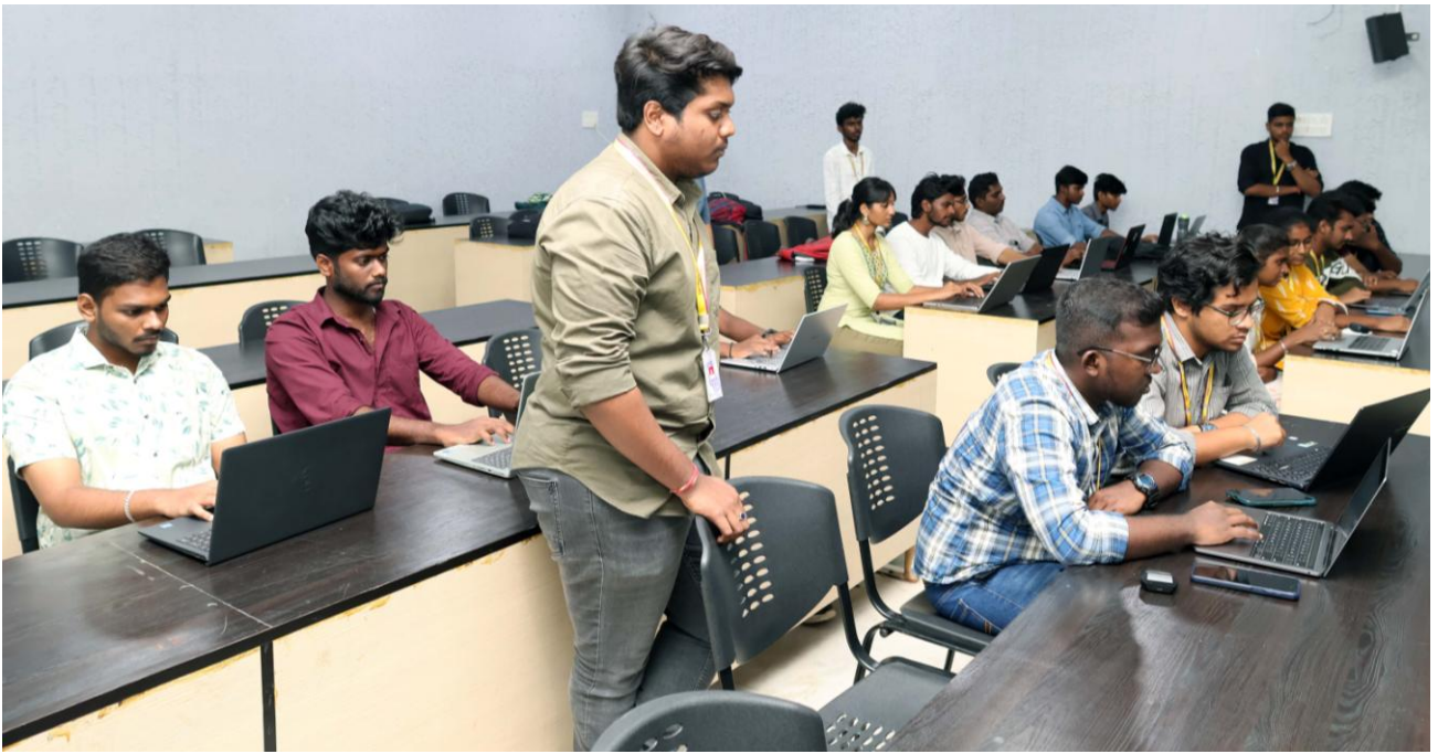
The Mozilla Club of Sathyabama Institute of Science and Technology conducted a "Data Story Telling" competition on 3.08.2023. In this competition, student participants worked on "Data Visualization" and presented the output for given data sets.