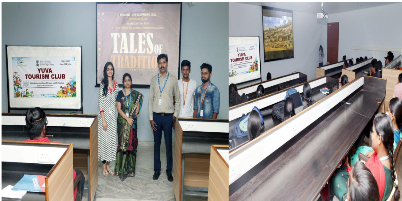
Tourism club of Sathyabama Institute of Science and Technology has conducted "Tales of Tradition" documentary event on 27.07.2023