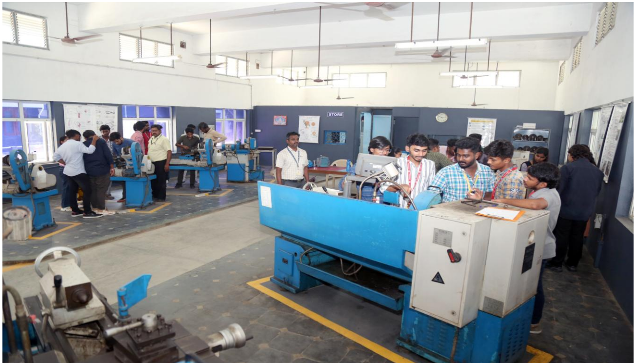
The Encore Club of Sathyabama Institute of Science and Technology conducted "Art of Lathe" workshop on 4.08.2023. In this workshop, student participants from various branches are given the exposure to working on Lathe Machine.