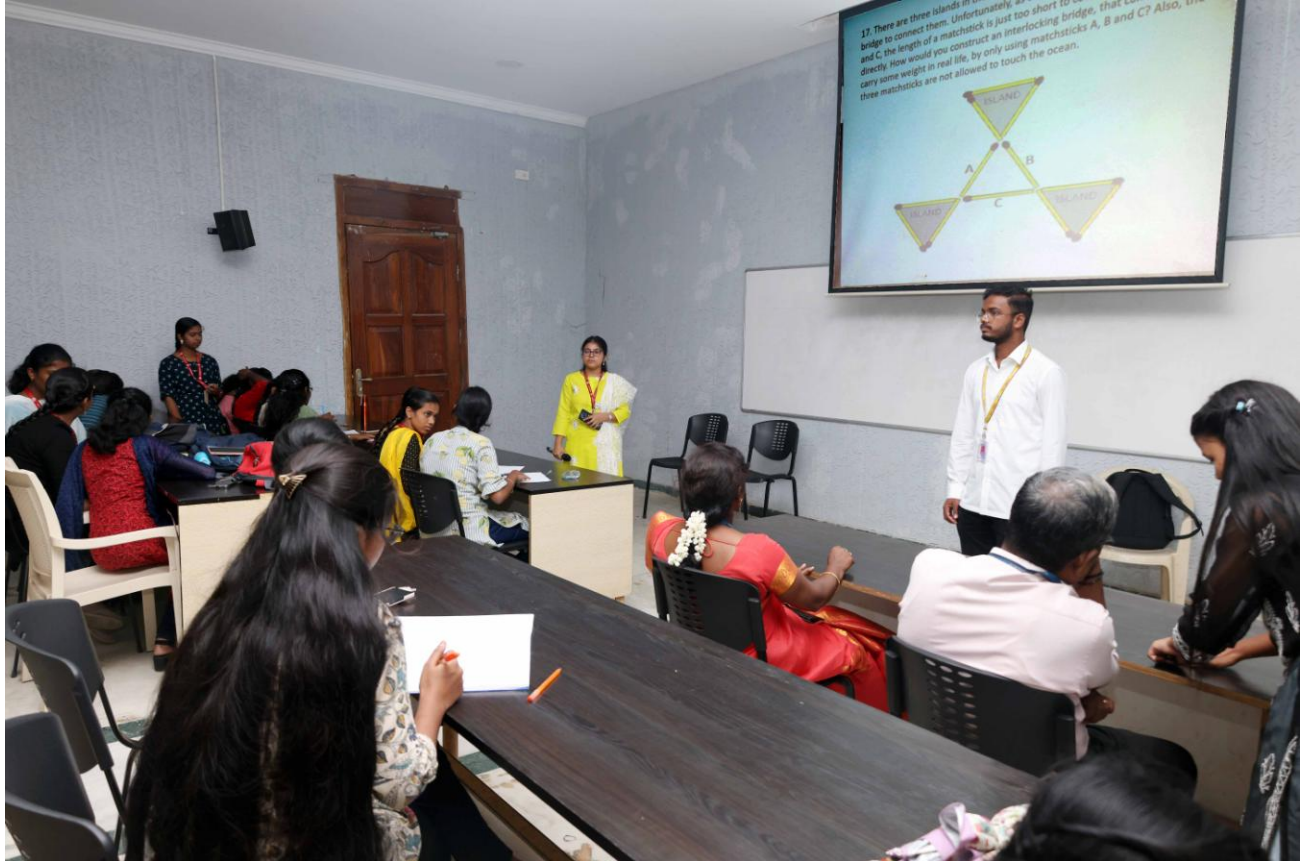
Maths club of Sathyabama Institute of Science and Technology conducted a competition titled " Math-Fiesta" on 27.07.2023. Student participants solved puzzles related to maths in this edutainment based event.