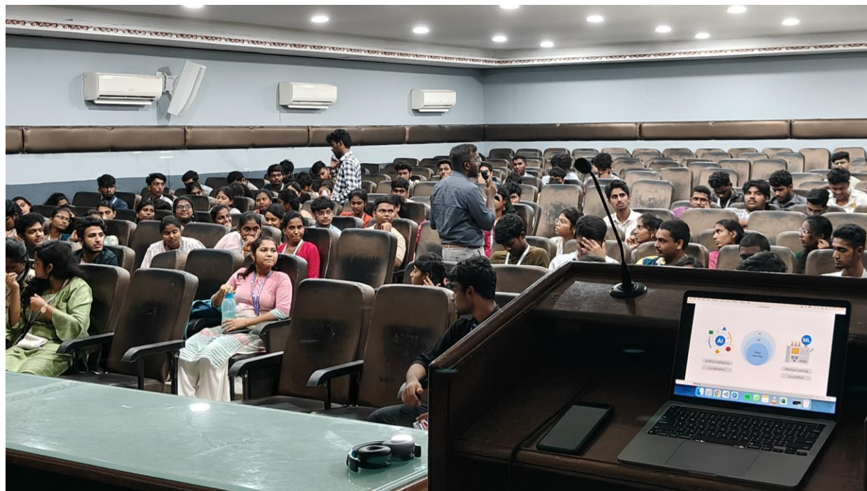
Artificial Intelligence Wizards Club organized a seminar on “A seminar on Generative AI” on 13.10.2023. In this informative seminar students interacted with speakers in peer to peer learning mode