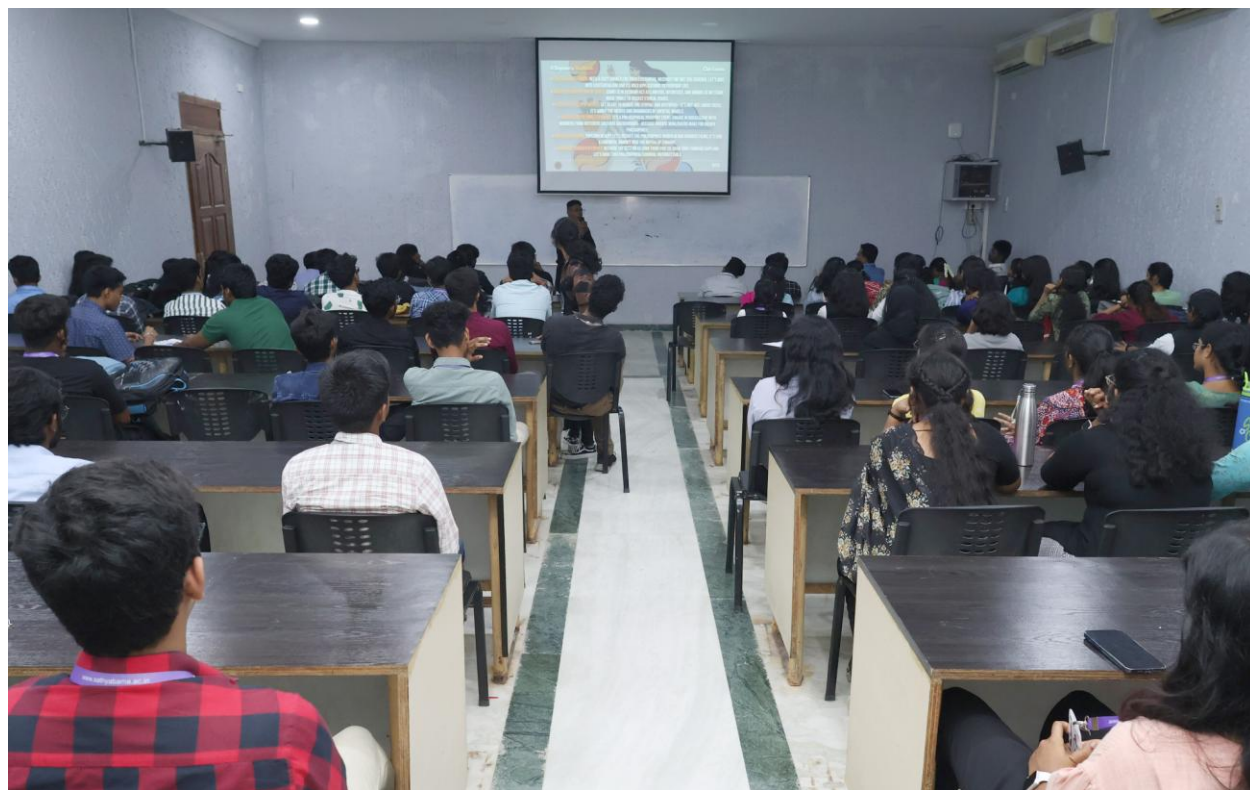
Philosophy and Open Discussion Club conducted orientation session on 18.10.2023