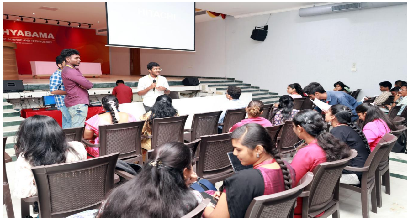
Catalyst club of Sathyabama Institute of Science and Technology conducted an event related presentation of project ideas – “Explore your Project” on 07.07.2023.