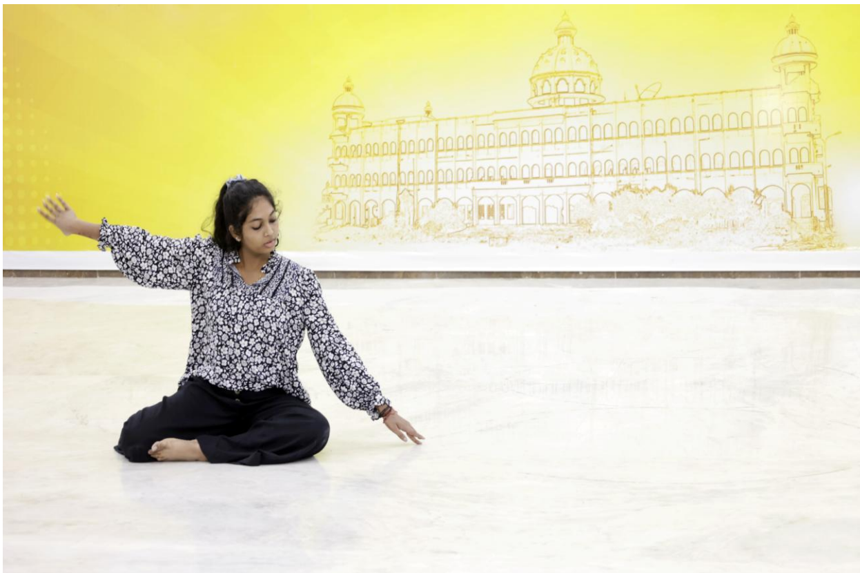
Dance club conducted "Auditions" on 17.11.2023. Enthusiastic students participated and exhibited their dancing talent