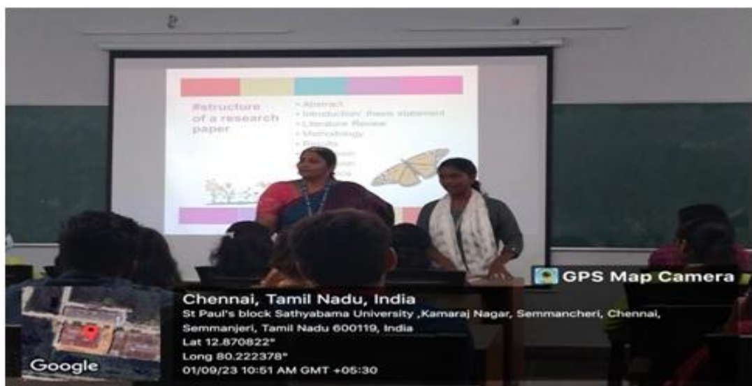
Catalyst club organized a program titled "Research Niche" on 01.9.2023. Expert speakers from the institution assisted student participants in shaping their thoughts into ideas