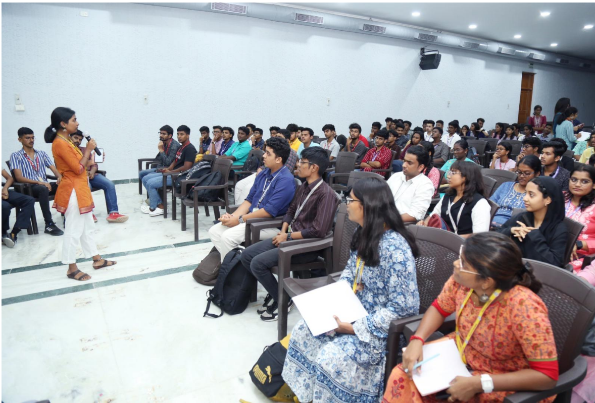
English Literary club of Sathyabama Institute of Science and Technology has conducted Narrative Nexus event on 31.08.2023. Student participants exhibited their literary skills in this event