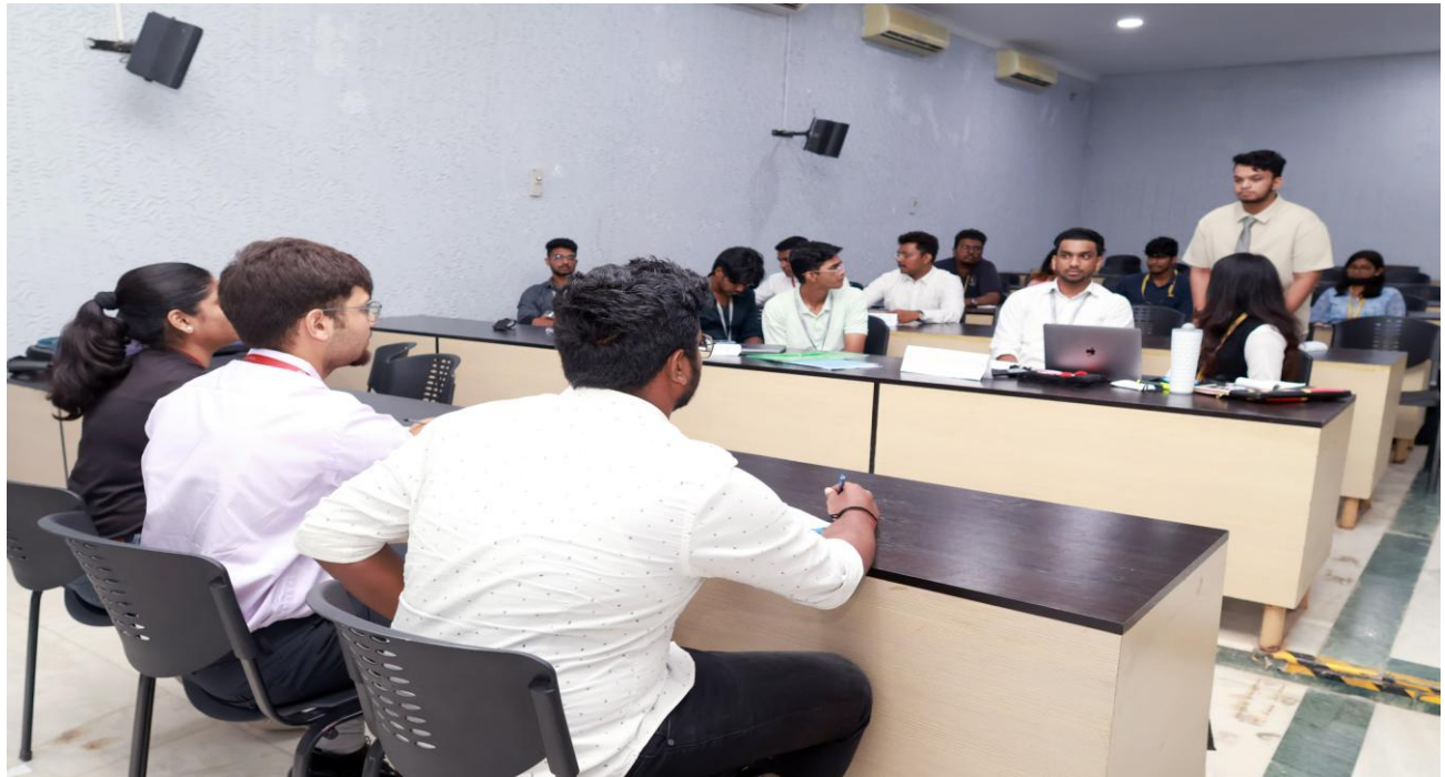
CompileX club of Sathyabama Institute of Science and Technology conducted a MUN competition on 06.07.2023. Enthusiastic students with excellent oratory skills participated in this versatile model of debate on Artificial Intelligence driven world and related challenges.