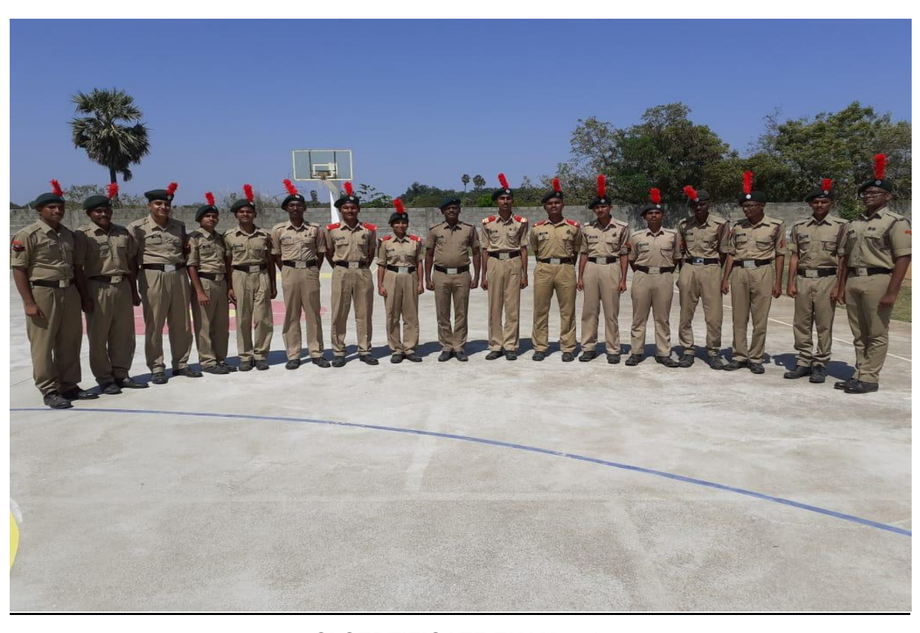
'C' CERTIFICATE EXAM 2019