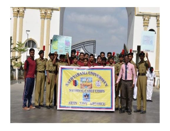
WORLD WATER DAY RALLEY AT SATHYABAMA-23 MARCH 2019