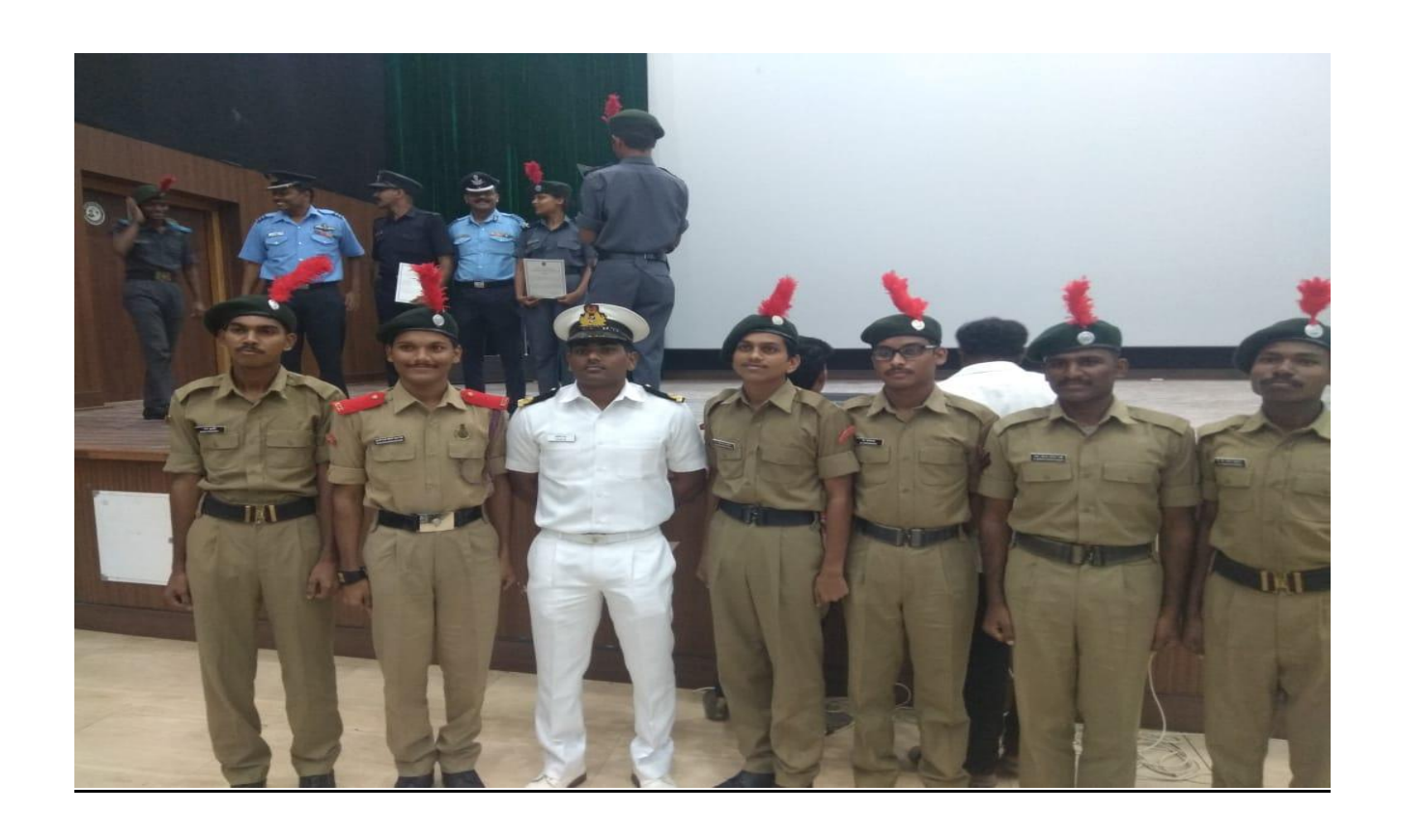
NCC DAY CELEBRATIONS