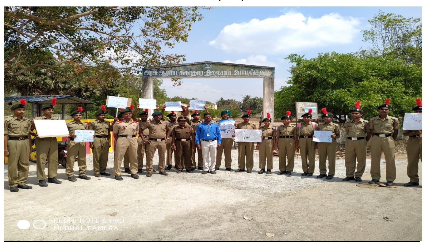
WORLD WATER DAY-22 MARCH 2019 IN SOZHAMANGALAM NEAR TAMBARAM