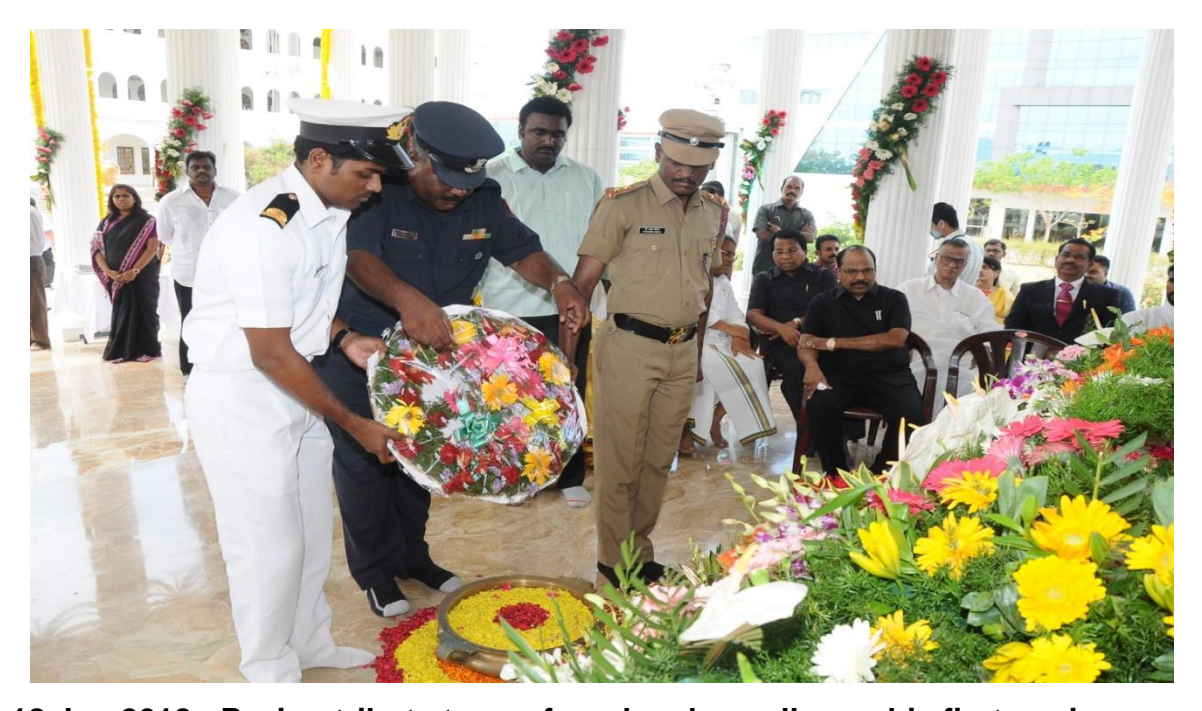
18 Jun 2018 - Paying tribute to our founder chancellor on his first anniversary