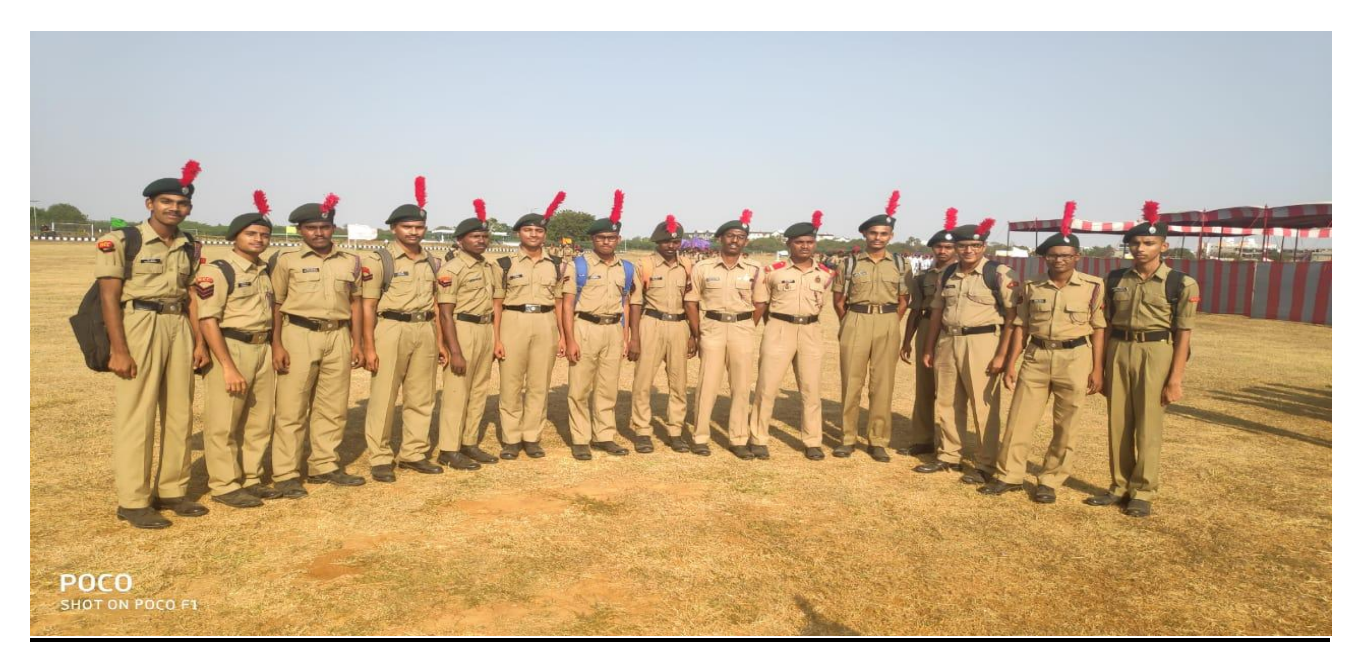
ATTENDED PASSING OUT PARADE (POP) AT OTA- 6 MARCH 2019