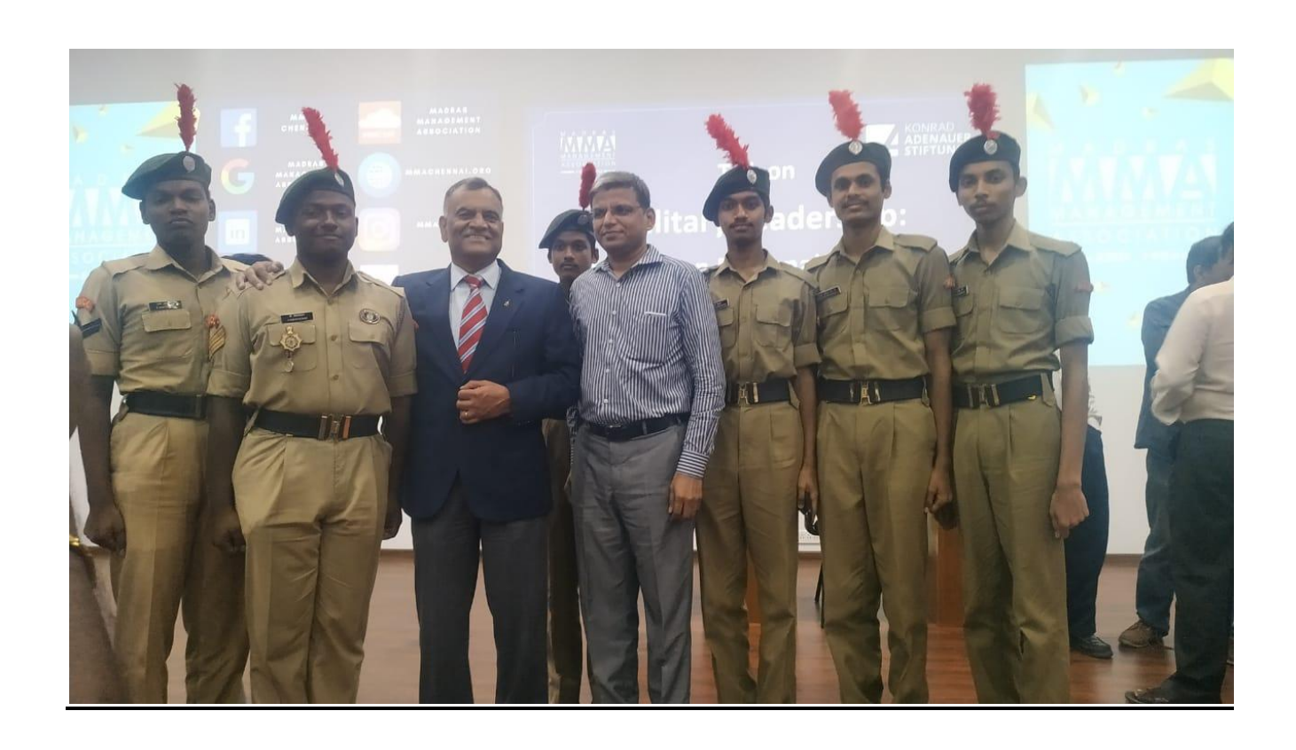
LEADER'S SPEAK-23 April 2019 MILITARY LEADERSHIP: Impact on National Security