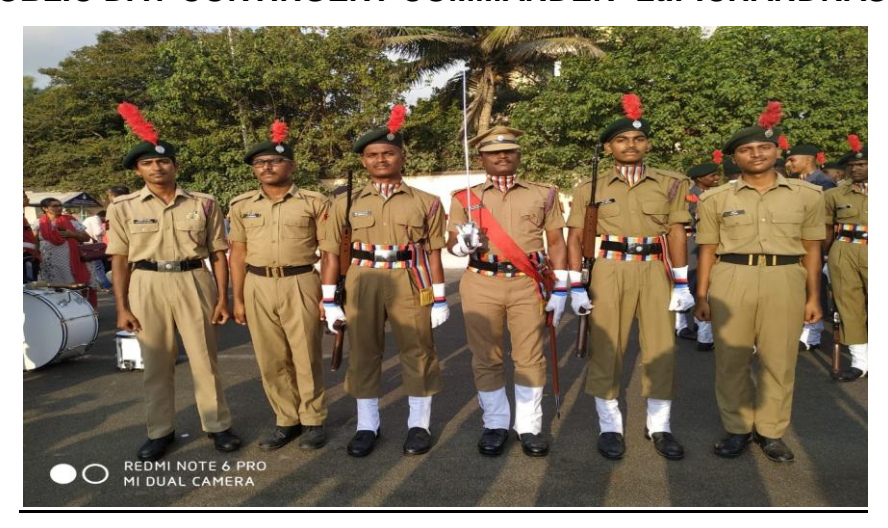
OUR NCC ARMY CADETS