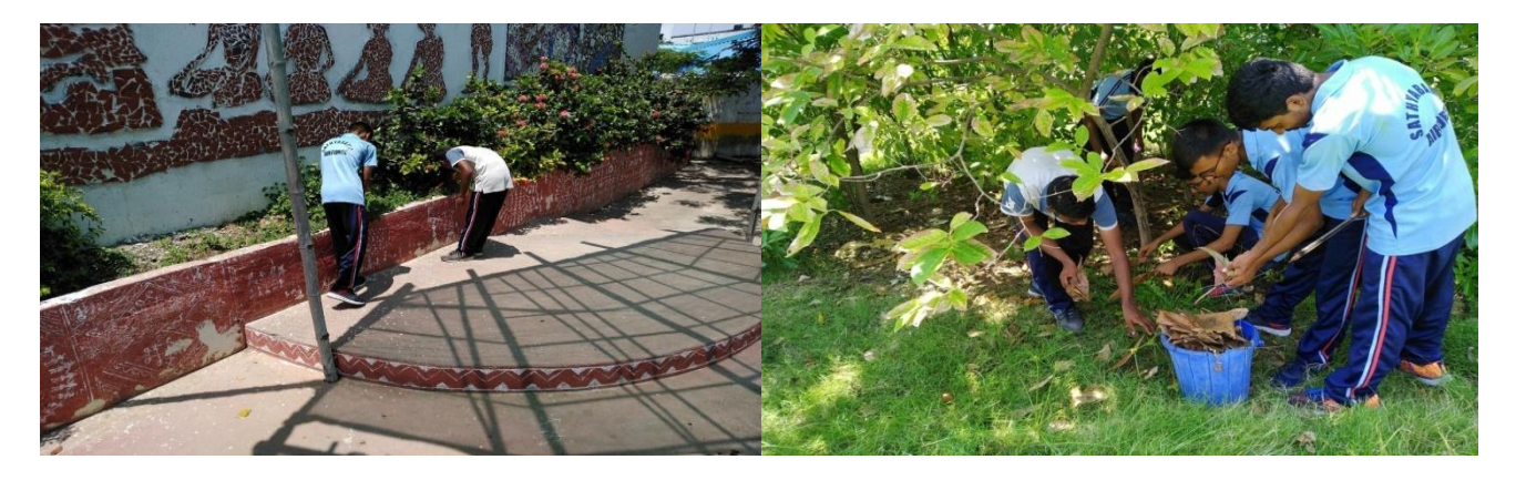
Swachchta Hi Sewa - Cleaning of Public Parks-25Sep 2018