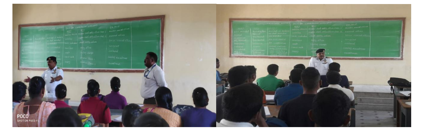
Surgical StrikeDay - Speech by 4 (TN) Navy Commanding Officer -29 Sep 2018