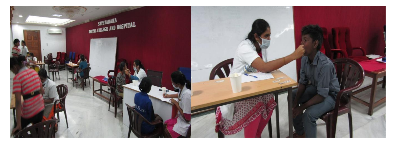
Dental Awareness and Screening Programme - 19 July 2018