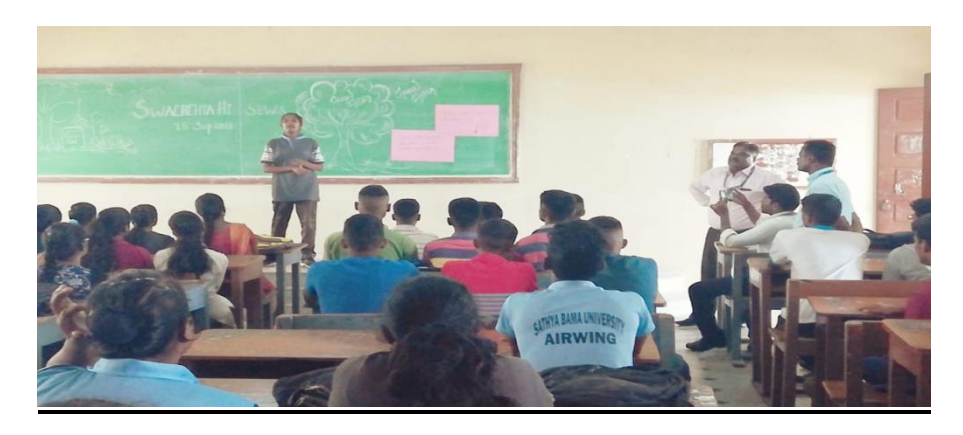
Swachchta Hi Sewa - Talk / Speech - 17 Sep 2018