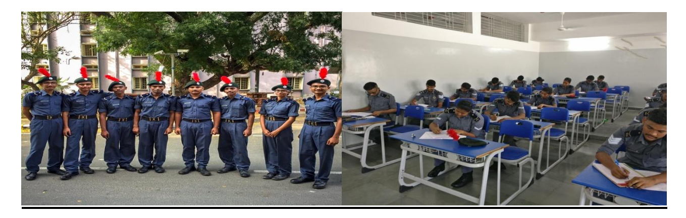
'B' Certificate Exam- 10 Feb 2019 'C' Certificate Exam- 23 Feb 2019