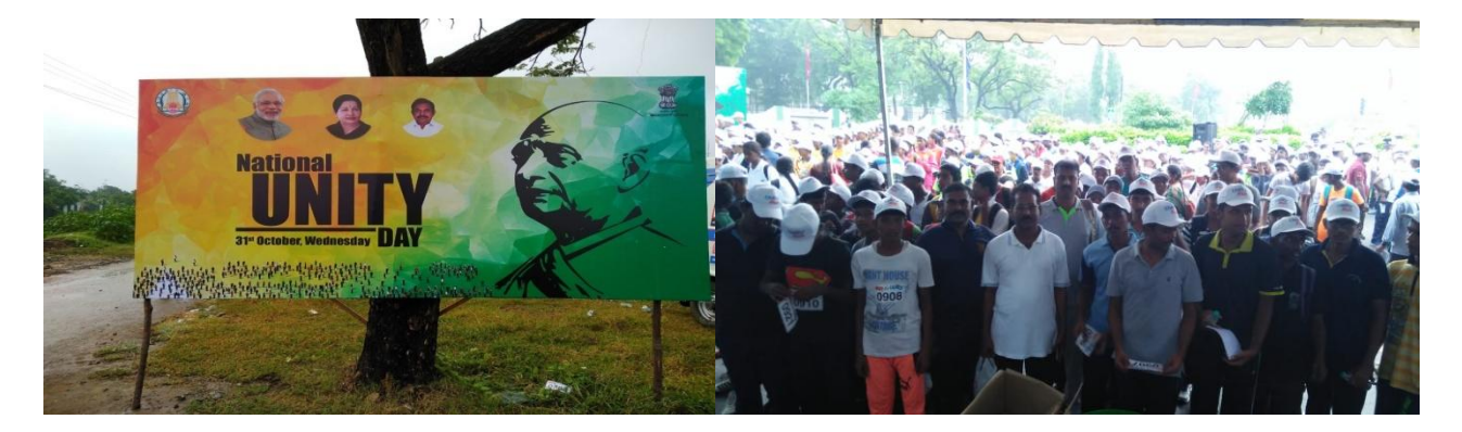
National Unity Day - Unity Marathon Run - 31 Oct 2018