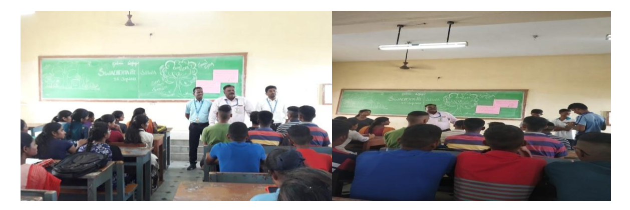
Swachchta Hi Sewa -Inaugural Speech - 15 Sep 2018