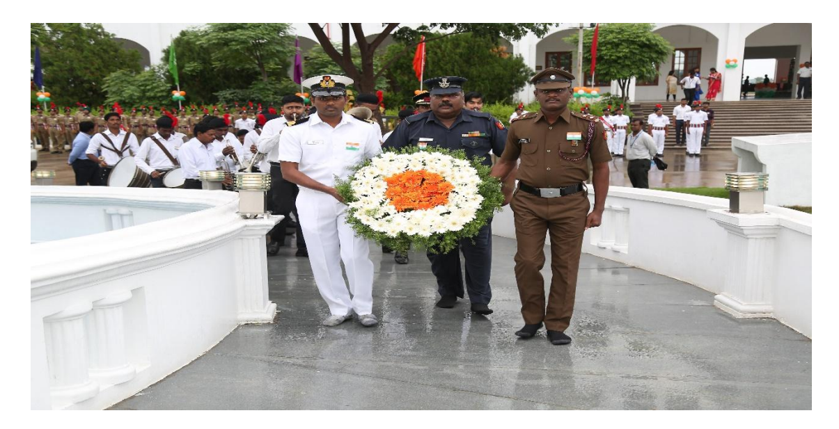
Paying tribute to our founder chancellor on his anniversary - 18 June 2018