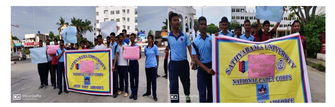
Swachchta Hi Sewa - Rally - 16 Sep 2018