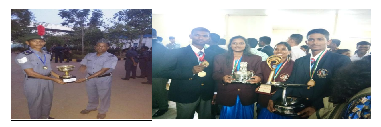
State Level (IGC) & National Level Competition (AIVSC)- 03 Nov 2018