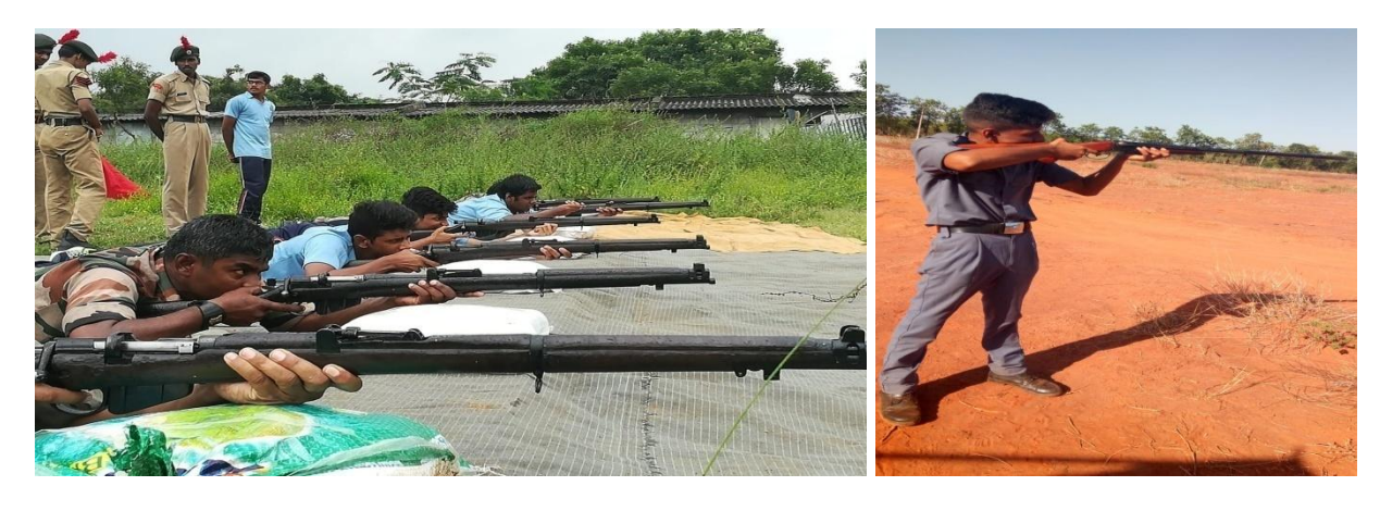
Range Firing -2018 – 19