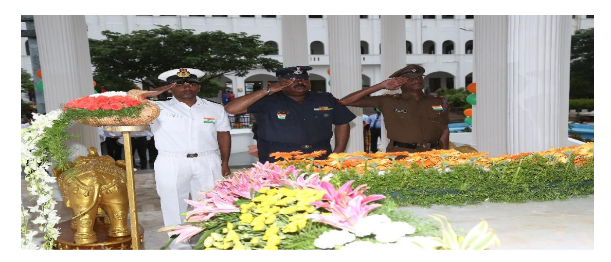
International Yoga Day - 21 June 2018