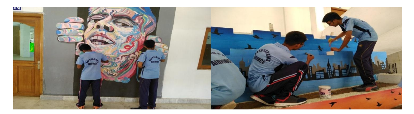
Swachchta Hi Sewa - Cleaning of Wall paintings -22 Sep 2018