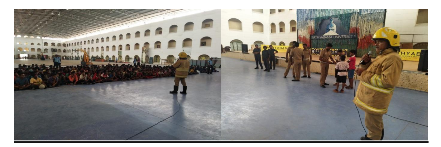
Fire Fighting& First Aid Demo - 25 June 2018