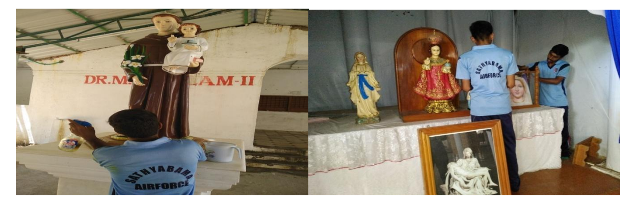
Swachchta Hi Sewa - Cleaning of Statues-20& 21 Sep 2018

Swachchta Hi Sewa - Cleaning of Streets- Adopted Villages - 19 Sep 2018