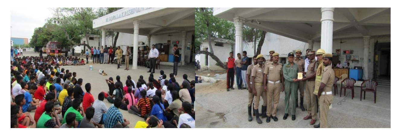
Fire fighting lecture - 21 July 2018