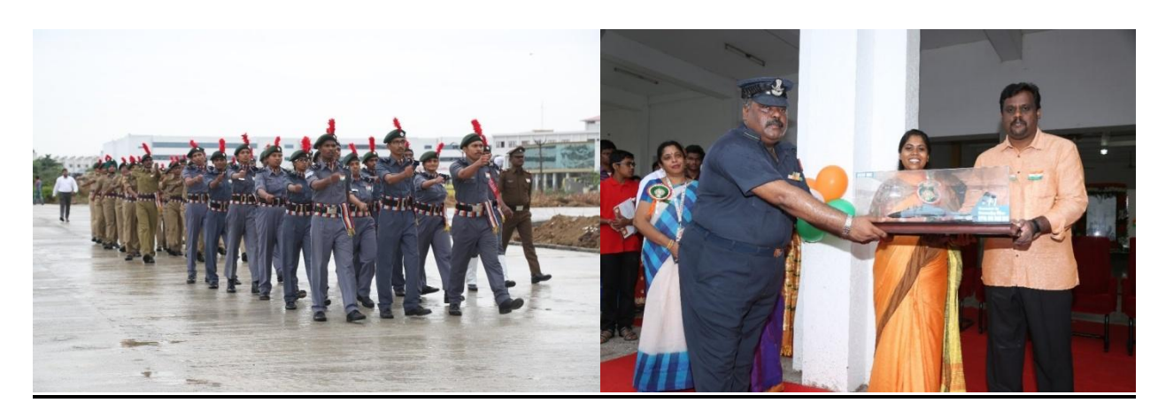
Independence Day Parade – 15<sup>th</sup> Aug 2018