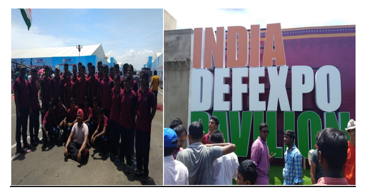
DEFENCE EXPO-11<sup>th</sup> APRIL 2018