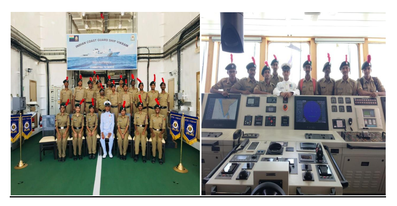
VIKRAM SHIP COMMISSIONING CERMONY- 11<sup>th</sup> APRIL 2018