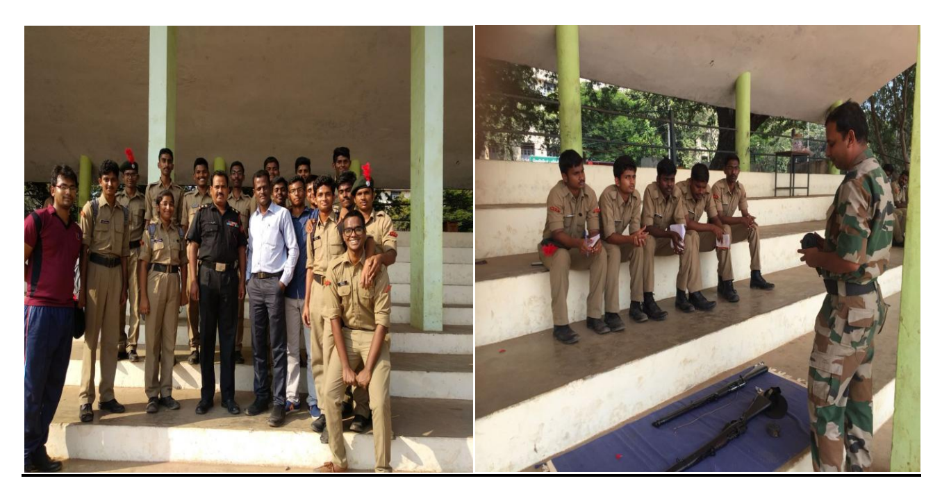
WEAPON / MAP READING CLASS IN MCC, CHENNAI