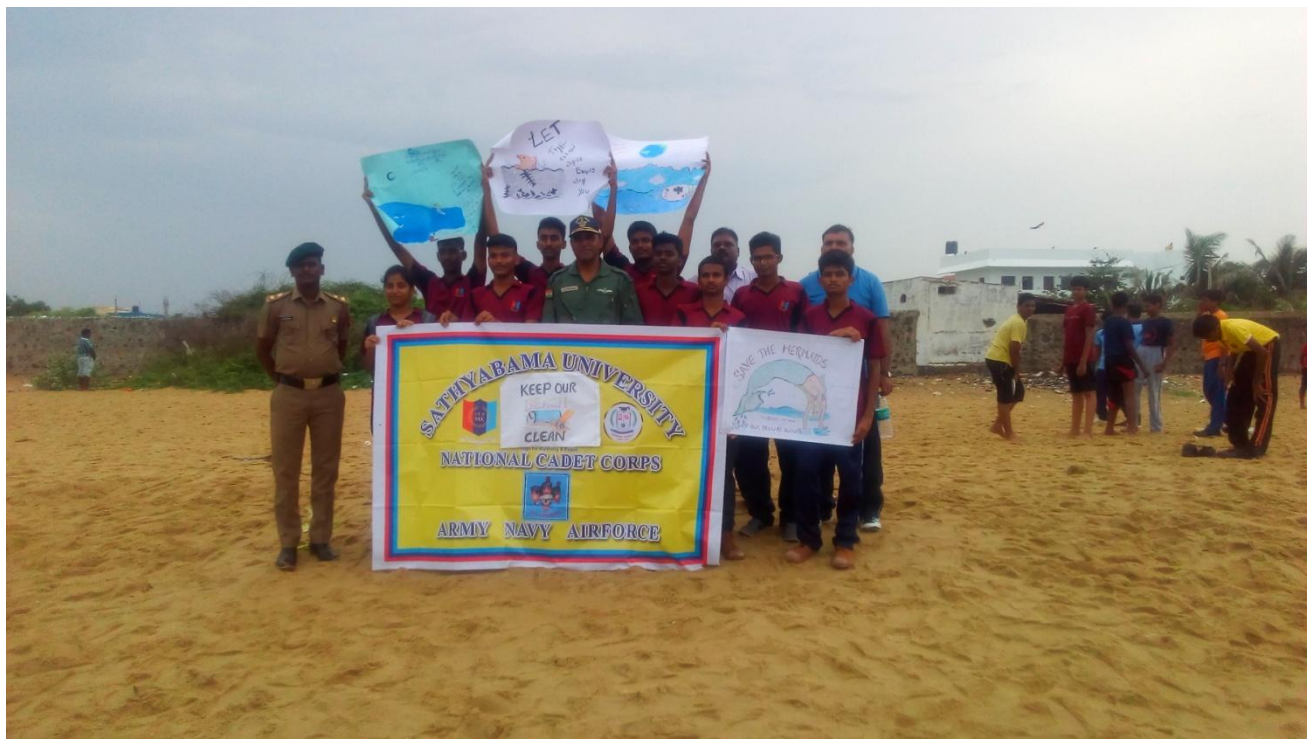
Coastal Cleaning on 30<sup>th</sup> July 2017