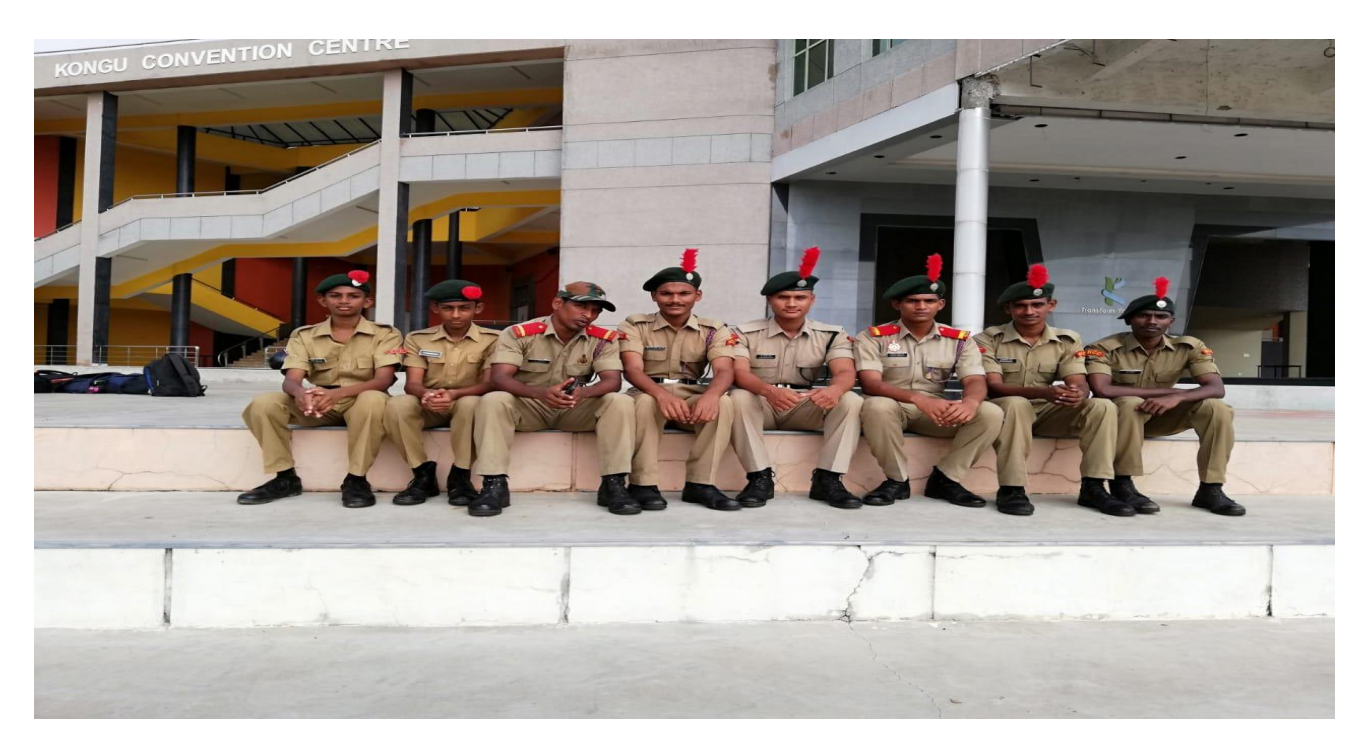
IGC SHOOTING CAMP- ERODE